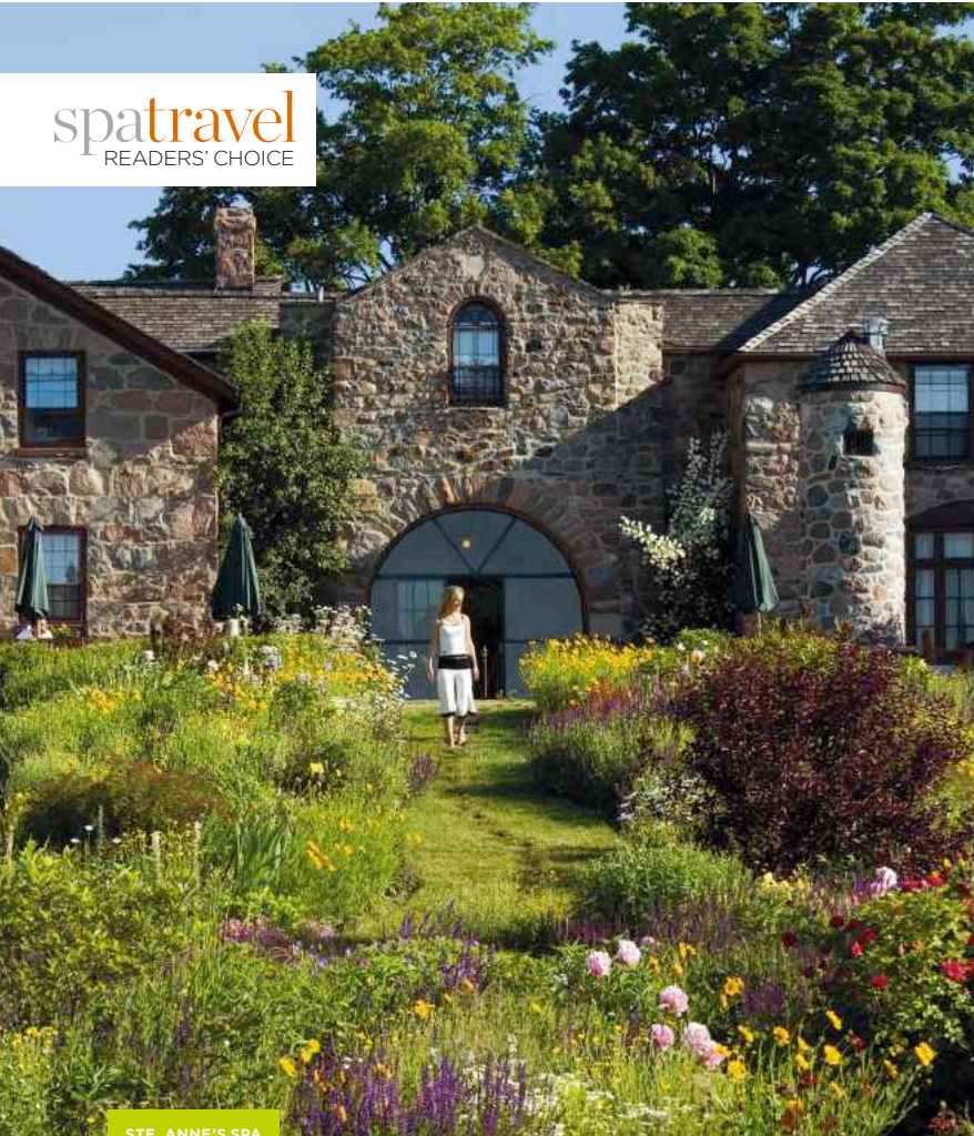
STE. ANNE'S SPA