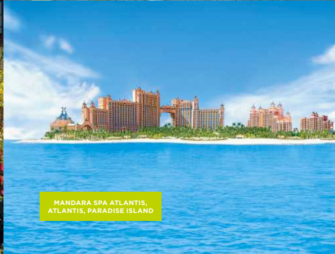
MANDARA SPA ATLANTIS, ATLANTIS, PARADISE ISLAND